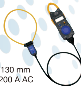
AC FLEXIBLE CURRENT SENSOR CT6280